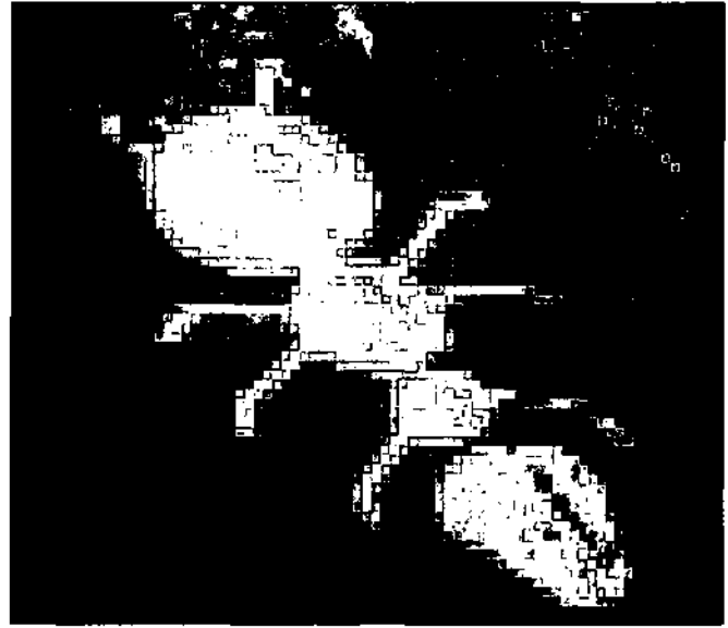
The Henwood Down formation, July 25, 1997, Hampshire, England.

As he implied in his book The Circles Effect and its Mysteries , p. 20, fair weather whirlwinds or ordinary atmospheric vortices could not be responsible. And we of course know that most of the crop-circle formations have occurred at night, and even under damp weather conditions, when summer whirlwind activity is absent or minimal.